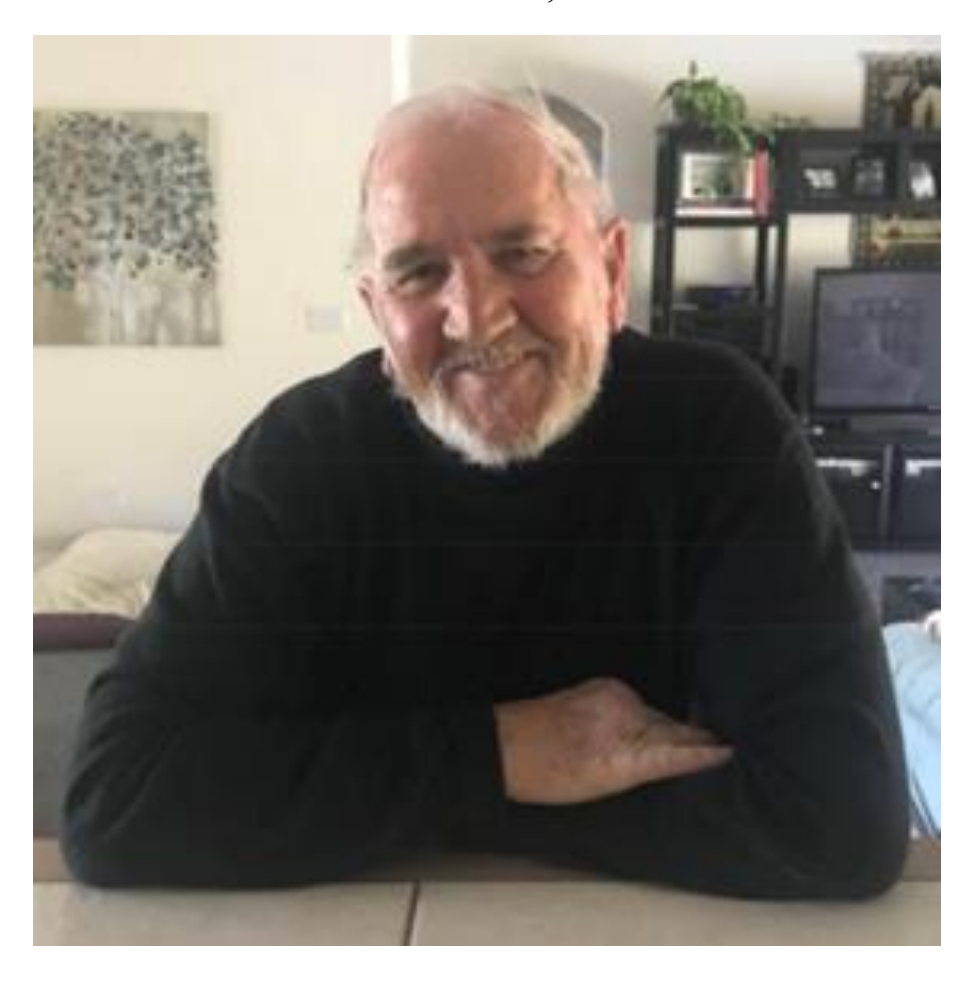
Born into Eternal Life June 19, 2024